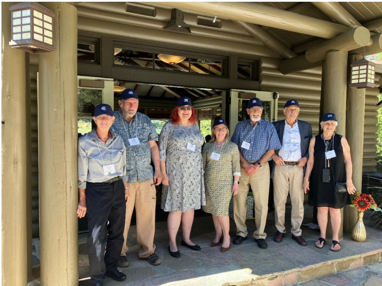
We had a number of CGS Presidents in attendance, past and present.

It was wonderful to see so many of you at our 125th Anniversary Celebration! We feel very lucky to be part of an organization with such a rich history and vibrant community of friends.